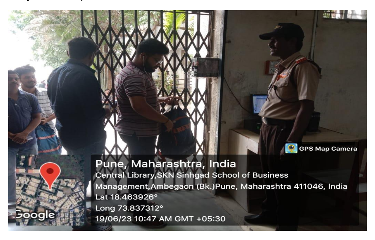
Issue / Return Counter